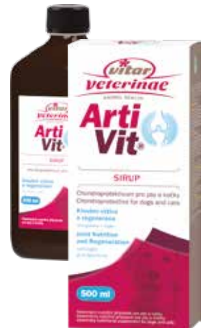
Article no: 4500002