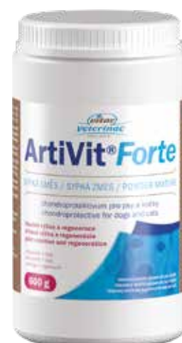
Article no.: 4500005