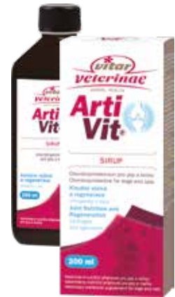
Article no: 4500001

Ingredients: sugar, water, hydrolysed collagen, glucosamine sulphate.2KCl, MSM, chondroitin sulphate, L-ascorbic acid (vitamin C), boswellia serrata extract, hyaluronic acid, preservative – potassium sorbate