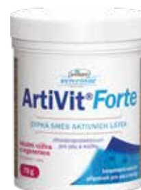
Article no.: 4500003

Ingredients: hydrolysed collagen, glucosamine sulphate.2KCl, MSM (methylsulphonylmethane), chondroitin sulphate, L-ascorbic acid, boswellia serrata extract, hyaluronic acid