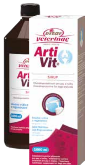
Article no: 4500012