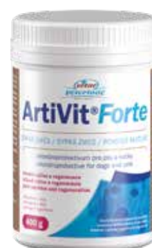
Article no.: 4500004